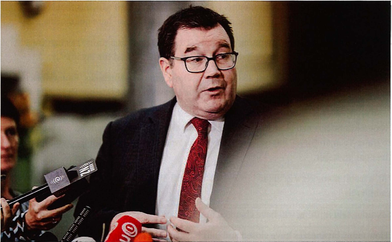
Deputy Prime Minister Grant Robertson.

Talks between the two countries have been going on for nine months, and Covid-19 Response Minister Chris Hipkins said this week that officials had been close to reaching an agreement at the start of February , but Australia decided it wanted to be able to make independent decisions.