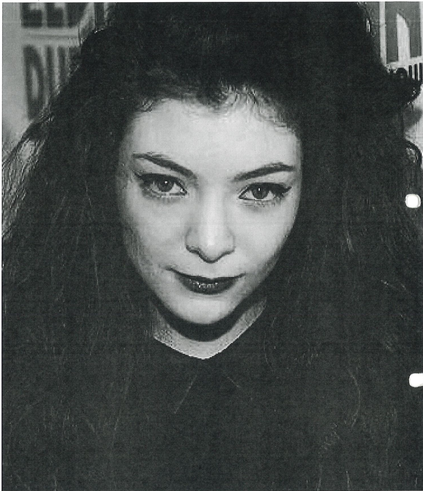
TOP OF THE POPS: Singer-songwriter Lorde

It's been billed as the biggest moment in Kiwi music in 25 years. Michelle Duff reports on Lorde's ascension to pop music's throne with her No 1 hit Royals.