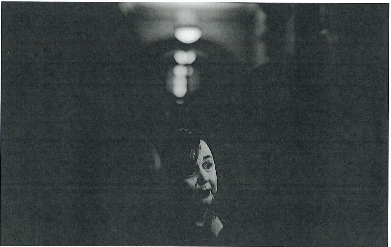
Minister in charge of managed isolation, Megan Woods.

Asked why people's attitudes had changed, Woods said: "I don't have insight into each and every individual in those facilities but one thing I would observe is that they are probably looking out their windows and seeing a level 1 world operating when they are living in level 4, which is quite different."