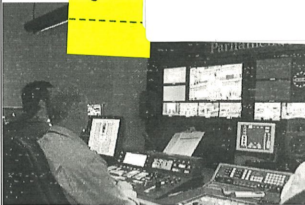
Inside the studios of Parliament TV.