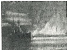
'Evacuation from Salonica'

The failure of the August offensive created doubts in London about the campaign, especially as the Western Front was assuming importance. General Sir Ian Hamilton, who was in charge of the British forces at Gallipoli, wanted more men. Opinion was against him. General Sir Charles Monro replaced him in mid-October and soon proposed evacuating the troops. Appalling weather conditions sealed the issue. A storm swept through the peninsula in late November. Water flooded the trenches and drowned men and drenched everything. The snow that followed left many dead from exposure. Survivors from both sides were miserable. In London, the authorities reluctantly agreed to a withdrawal.