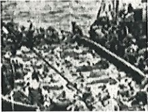
Evacuation of wounded

The failure of the August offensive created doubts in London about the campaign, especially as the Western Front was assuming importance. General Sir Ian Hamilton, who was in charge of the British forces at Gallipoli, wanted more men. Opinion was against him. General Sir Charles Monro replaced him in mid-October and soon proposed evacuating the troops. Appalling weather conditions sealed the issue. A storm swept through the peninsula in late November. Water flooded the trenches and drowned men and drenched everything. The snow that followed left many dead from exposure. Survivors from both sides were miserable. In London, the authorities reluctantly agreed to a withdrawal.