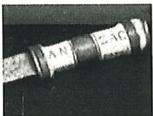
Anzac Jack knife and case

Left behind were the dead: 87,000 Turks and 44,000 British and French, including 8700 Australians and 2721 New Zealanders. The wounded numbered in the hundreds of thousands, perhaps as many as 160,000 Turks and up to about 100,000 British allies, including 20,000 Australians and nearly 5000 New Zealanders.