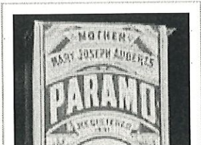
Mary Joseph Aubert's medicine

Mary Joseph Aubert was a French Catholic nun who became interested in medicinal uses of native plants. She spent much time among Māori, particularly on the Whanganui River, and created a number of herbal remedies. She had knowledge of botany, chemistry, nursing and medicine, but also learnt about rongoā through her work with Māori. Her products, a blend of Western medicine and rongoā, were sold throughout New Zealand.