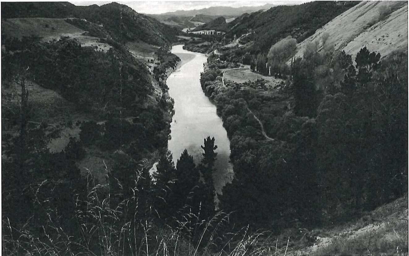
Whanganui River

In a world first, a New Zealand river will be recognised as a person.