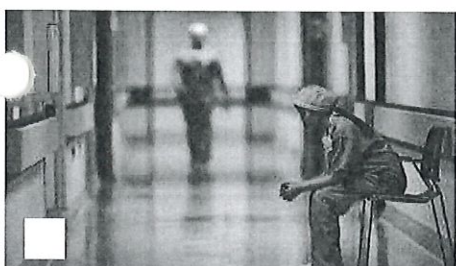
Kiwi nurses threaten to walk off the job due to shortage of masks, gloves