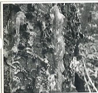
Kauri bleeding gum