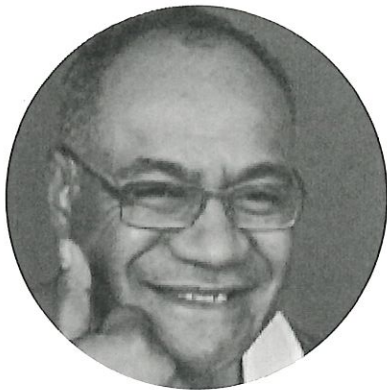
Oscar Kightley Subject