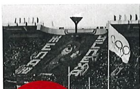
Olympic Games: Antwerp, Belgium, 1920