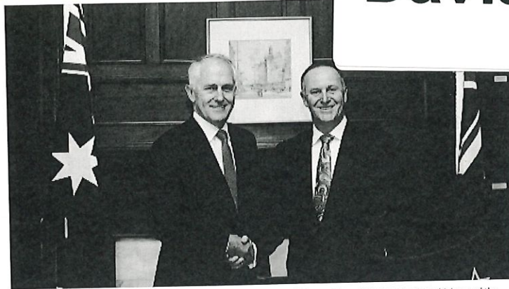
An agreement between Australian Prime Minister Malcolm Turnbull and former Prime Minister John Key which eased the path to citizenship for Kiwi expats has been "gutted", say expats.