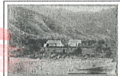
( http://www.thehook.org.nz/assets/enterprise/whitesbay2.jpg) Southern end of Cook Strait's telegraph cable - Whites Bay 1871, Click image to enlarge

The isolated and often stormy situation of the White's Bay ( http://maps.google.co.nz/maps?f=q&hl=en&geocode=&q=whites+bay&ll=-41.427283,173.9534&spn=0.42835,0.878906&ie=UTF8&ll=-41.371398,174.058113&spn=0.111302,0.236549&z=12&iwloc=addr ) Cable Station made it an unpopular posting. The staff and equipment were moved to Blenheim ( http://maps.google.co.nz/maps?q=Blenheim, Marlborough&ie=UTF8&split=0&q=nz&ei=MZ6LSFX-NZK2sAPHTJ35CA&ll=-41.509799,173.953228&spn=0.023139,0.053902&z=14&iwloc=addr ) in 1873, and the telegraph station finally closed in 1896, after a direct link had been established between Wellington and Christchurch. A building from the cable station is still at White's Bay. 2