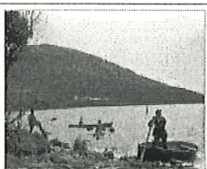
( http://www.thehook.org.nz/assets/enterprise/cablebay.jpg ) Cable Bay, the Nelson Provincial Museum ( http://www.museumnp.org.nz/ ), Tyree Studio Collection 179078/3 Click image to enlarge

The sub-marine engineering of the day was fraught with difficulties from weather, sea depth and currents. It was most important to keep the copper wire conductors protected and insulated, with gutta percha, a latex coating from Malaya (Malaysia), being used to cover them. The first cable was expected to last 10 years, but continued in use for 41 years. 4