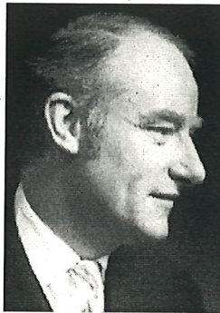
Francis Harry Compton Crick