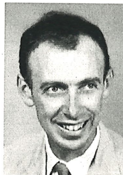
James Dewey Watson