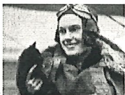
Jean Batten and Buddy the cat