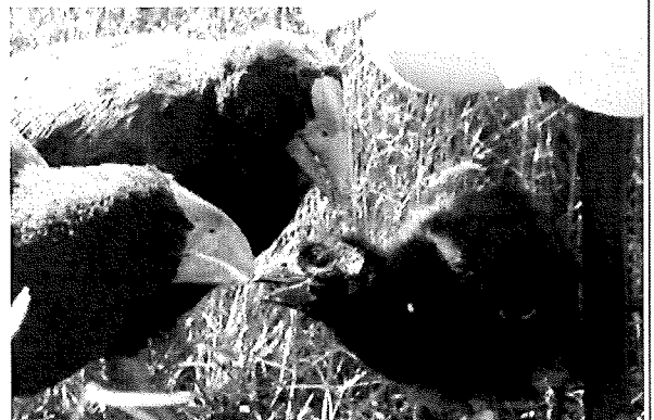
Takahē have 1 or 2 chicks a year

Stoats are predators of takahē. In 2007, there was a stoat plague that halved the takahē population in the Murchison