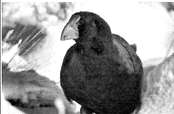
Takahē may retreat to forest for shelter when snow is thick

In the wild, takahē inhabit native grasslands. They eat mostly the starchy leaf bases of tussock and sedge species, and also tussock seeds when available. If snow cover is heavy, they will move to the forest and feed mainly on underground rhizomes of the summer green fern.