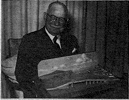
Sir John Allum

Stories about paying tolls appeared in the paper even before the Bridge opened - the toll for a car was 2/6 (15 cents). However that didn't seem to stop the volume of traffic - over 20,000 vehicles crossed the Bridge on the first day - One million vehicles had crossed the Bridge by mid-August, just eleven weeks after the Bridge's opening.