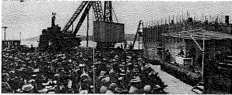
Marking the foundation