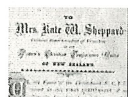
Thanking Kate Sheppard