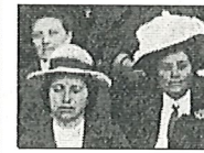
Māori in the WCTU