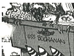
USS Buchanan cartoon

David Lange, in seeking a softening of Labour Party policy on this issue, found that there was little room to move; party activists were unwilling to draw distinctions between nuclear propulsion and nuclear weapons. The mood of the nation was also against such political manoeuvring. David Lange may well have hinted to George Shultz that the policy could change, but George Shultz had convinced himself that he had an assurance that David Lange would overturn Labour's policy. He later claimed that he felt betrayed by the way things unfolded.